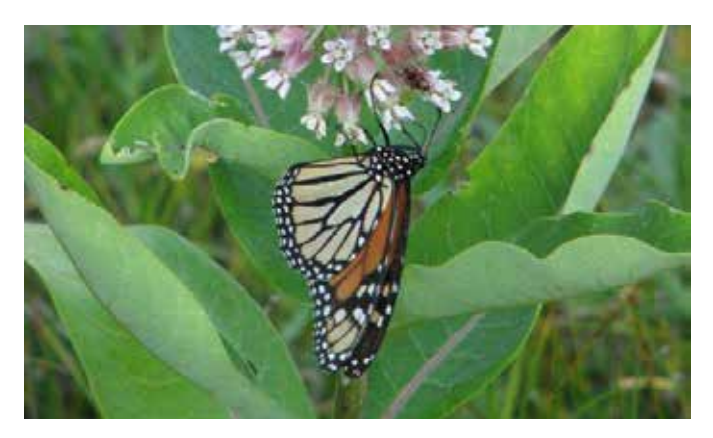
Monarch butterfly on native milkweed.