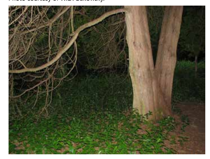
Dog-strangling vine invading deep shade forest.