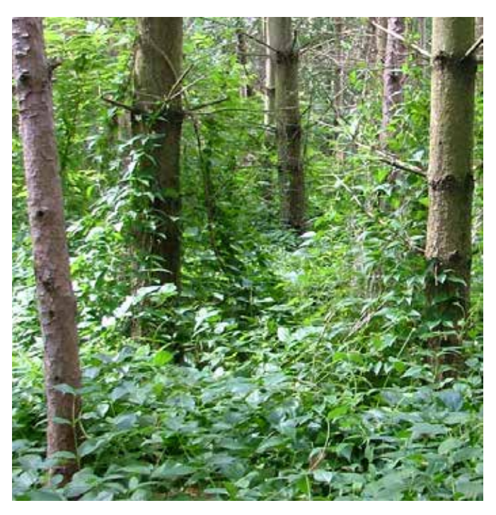
Dog-strangling vine invading a natural area.

Dog-strangling vine can inhibit recreational activities in areas where it has become established. The dense tangled mats of vegetation are difficult to walk or bike through, and pets can get tangled in the vines. In the winter, the dead dog-strangling vine stems remain and can hinder skiing and snowshoeing along trails. Dog-strangling vine also reduces the aesthetic value of favourite nature areas by reducing the number and variety of native species.