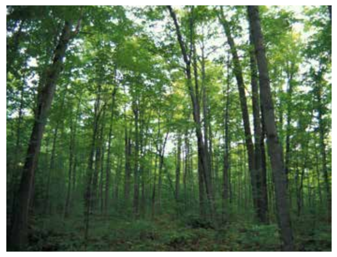
Deciduous forest.