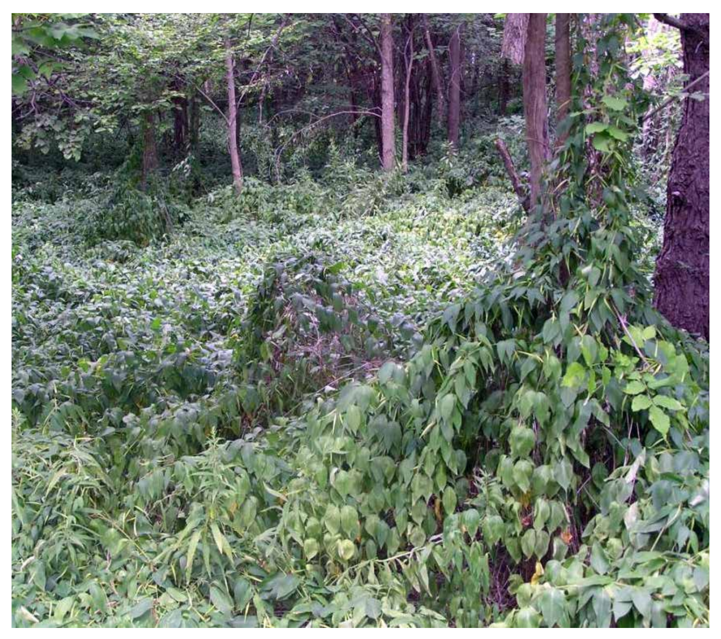
An example of an established dog-strangling vine population.

You are responsible for ensuring that your project follows all relevant laws, including the Endangered Species Act (ESA). If protected species or habitats are present, an assessment of the potential effects of the control project could be required. Consult with your local MNRF district office early in your control plans for advice (http://www.ontario.ca/government/ministry-natural-resources-and-forestry-regional-and-district-offices) or visit https://www.ontario.ca/environment-and-energy/how-get-endangered-species-act-permit-or-authorization to learn more about specific permitting requirements.