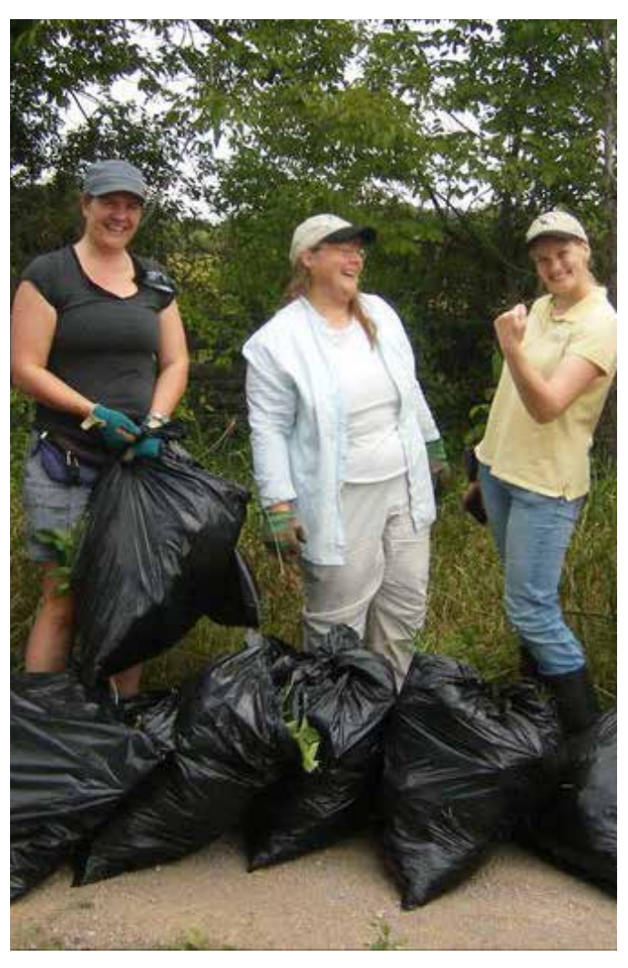
Volunteers after a successful day of pulling.

For some established populations, land managers have reported that manual removal of seed pods, though time-consuming and intensive, has prevented populations from spreading further. The best time to remove seed pods is just before they start to dry out and split (early to mid August with follow-up removal until the end of September). This will not eradicate the plant, but will prevent further spread, and can be used in combination with mowing for increased effectiveness. Efforts to control spread of the species should focus on areas in which seed pod growth is prolific, such as areas with high sunlight or areas with the densest growth of plants.