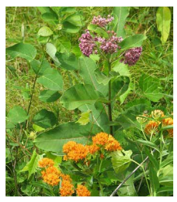
Milkweed species.

Seedlings in the sunflower family can resemble dog-strangling vine; however sunflower seedlings grow as erect or spreading plants and do not twine. For most Helianthus species in Ontario, only the lowermost leaves are opposite, however some of them do have entirely opposite leaves. Secondary characteristics can be used to differentiate them, such as fine downy hairs all over the stem of the Helianthus species or a distinct tri-nerved leaf (three ridges extending from petiole on the back of the leaf, instead of one down the centre like most species).