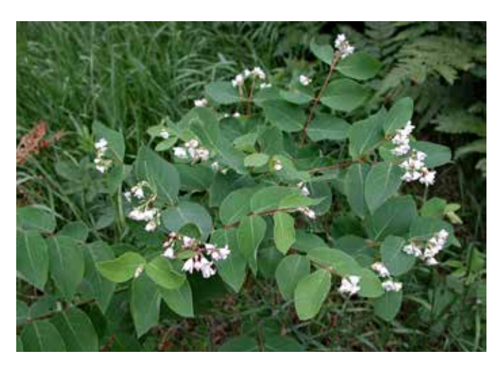
Spreading dogbane.

Seedlings of this species also resemble dogstrangling vine; however, as they mature the stems turn a purplish to reddish colour and the stems are always erect or inclined, never twining like dogstrangling vine. The leaves of most Apocynum species are usually drooping and often longer and narrower than dog-strangling vine leaves.