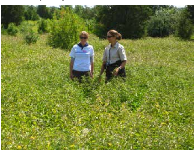
Dog-strangling vine Invading old field.