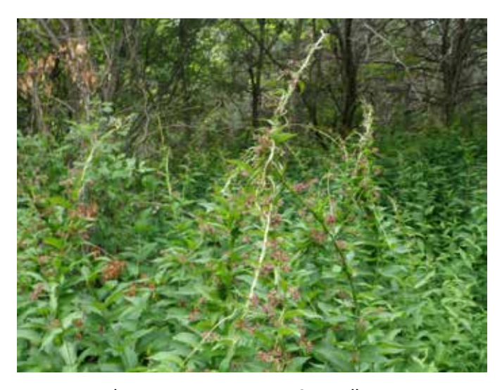
Dog-strangling vine grows up to 2 m tall.

Dog-strangling vine is a perennial herbaceous plant with a woody rootstalk that can grow to heights of 0.6 to 2 metres (24-80") or more.