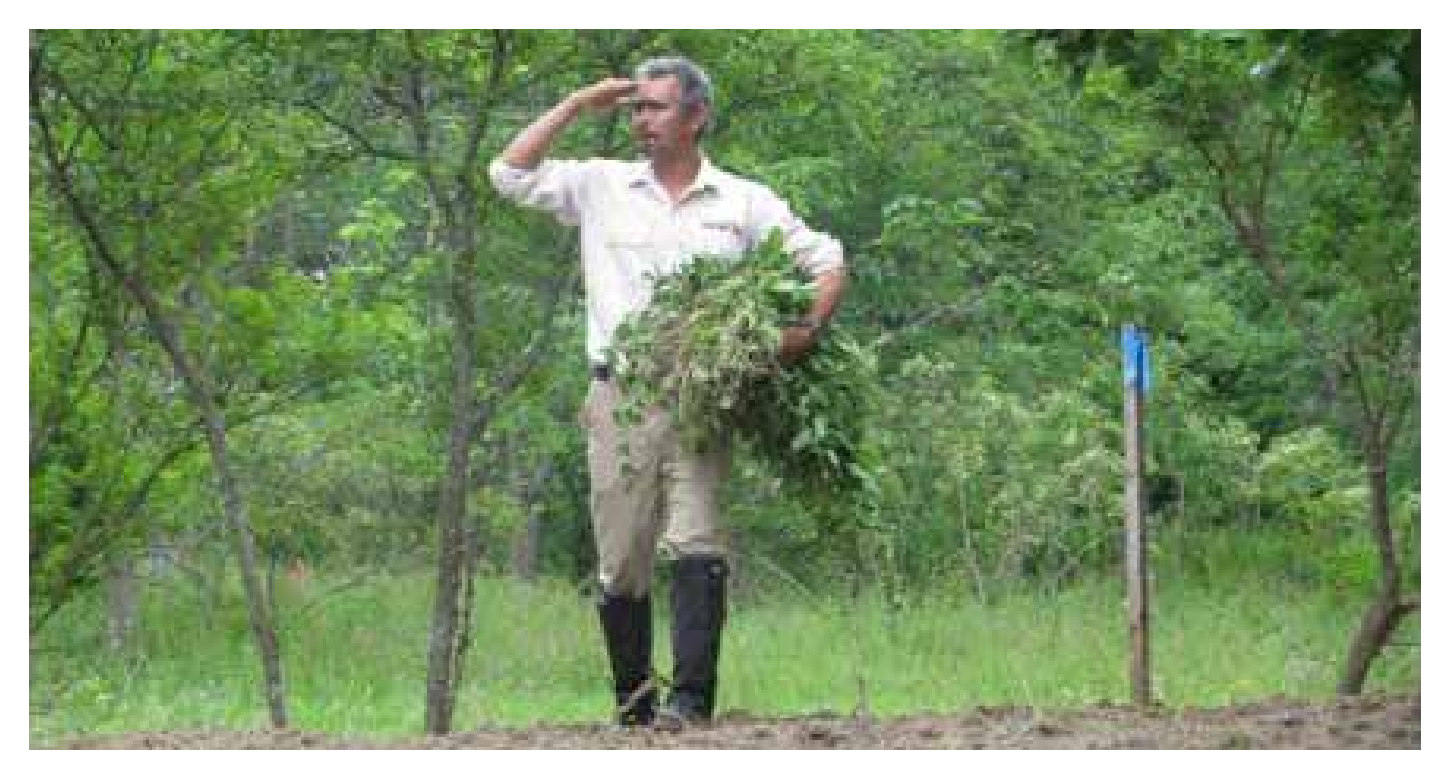
Removing cut plant material.

Agriculture and Agri-Food Canada (AAFC) are leading a dog-strangling vine biocontrol project in collaboration with scientists from the University of Toronto, Carleton University, University of Rhode Island and the forest management company, SilvEcon Inc. A moth, Hypena opulenta , which like DSV is native to Ukraine, was identified as a possible defense against dog-strangling vine in 2006. Prior to its approval for release in 2013, the insect underwent extensive testing to confirm that it can only survive on dog-strangling vine and will not feed on native plants. The Hypena release program started in the fall of 2013 to test overwintering in the Ottawa area and was scaled up in 2014 with over 12,000 caterpillars released at Ontario field sites to date. Results have been very encouraging with entire plants yellowing in response to insects feeding on just a few leaves. The AAFC team will continue to monitor these initial release locations for additional impact on the dog-strangling vine plants, spread of the insects and successful overwintering. These "nurse" sites will form the basis of a larger release program planned throughout Ontario in 2015.