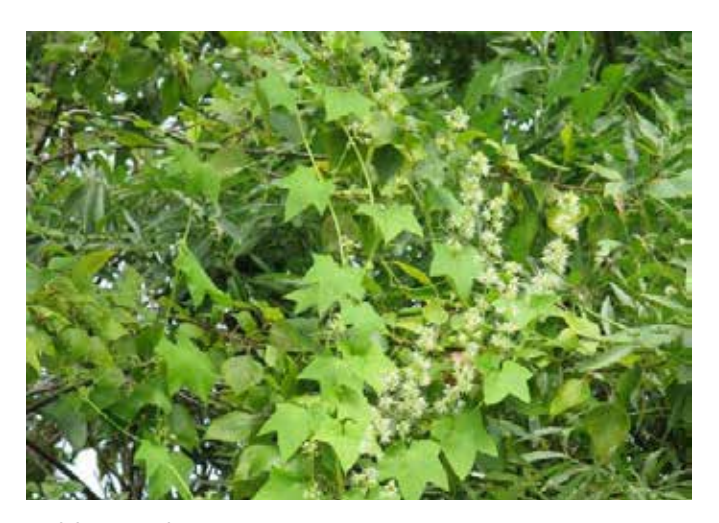
Wild cucumber.

Wild grape (Vitis riparia), wild cucumber (Echinocystis lobata) and virginia creeper (Parthenocissus quinquefolia) are all native vines that may be confused with dog-strangling vine. None of these vines twine, but rather climb by tendrils (specialized stem or leaf with a threadlike shape that is used by climbing plants for support).