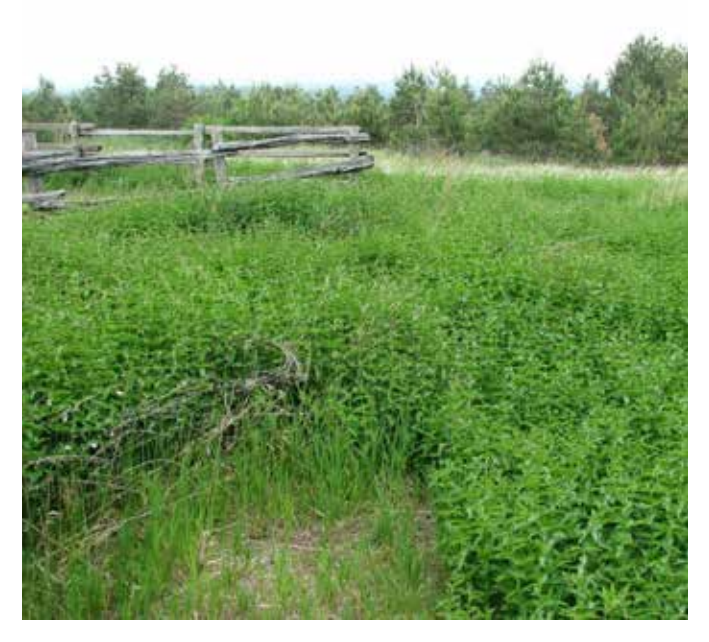
Dog-strangling vine infestation in an old agricultural field.

Dog-strangling vine is increasingly abundant in agricultural fields and pasture lands across Ontario. Recent observations show that it is moving into corn and soybean fields. There are reports of livestock avoiding this plant and some literature suggests it may be toxic to mammals (e.g. cattle). Heavy growth of dog-strangling vine can short-circuit electric fences around pastures. Livestock can also have difficulty moving through dense mats of the vine.