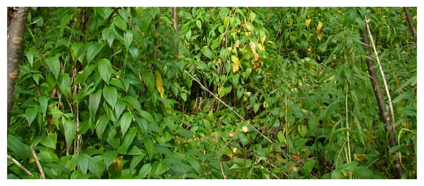
Dog-strangling vine forms thick mats of vegetation that can hinder recreational activities.

In the United States, dog-strangling vine is more commonly referred to as pale swallowwort, and some taxonomists have assigned it to the genus Cynanchum . In this document, the genus Vincetoxicum is referenced, and the widely accepted Canadian common name dog-strangling vine is used.