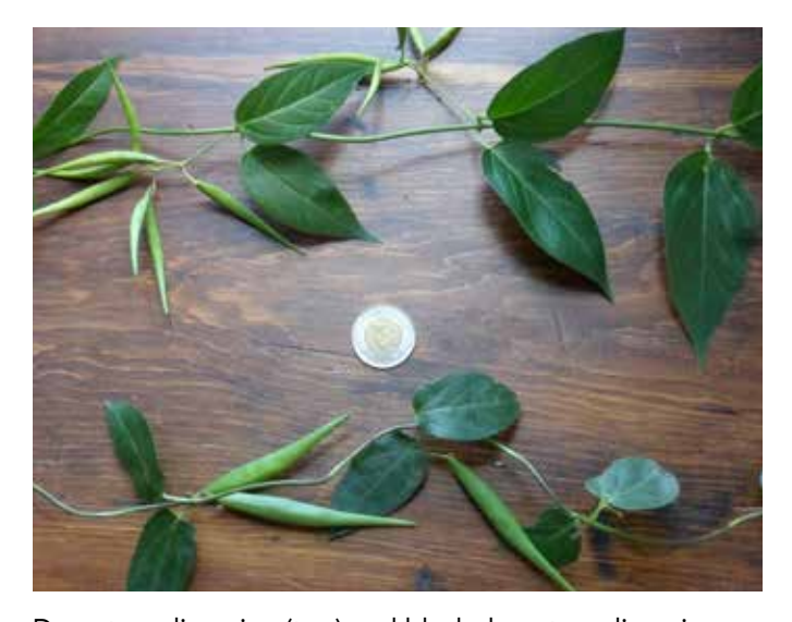
Dog-strangling vine (top) and black dog-strangling vine (bottom) comparison.