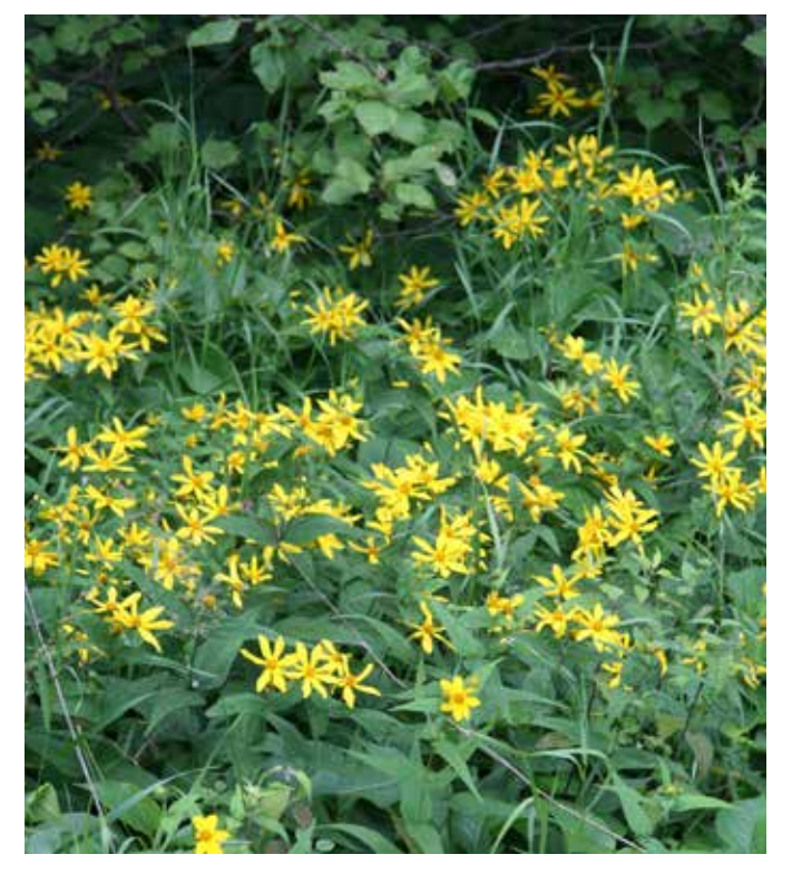
Sunflower species.