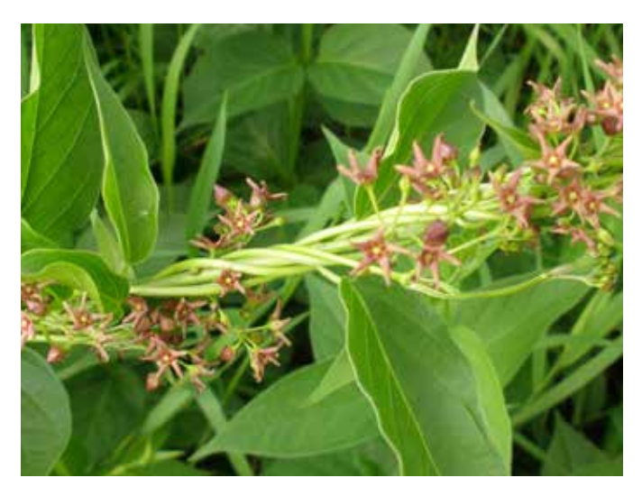
Dog-strangling vine stems twine around each other.

The stems can be somewhat downy (fine hairs) and they can twine or climb (dependent on available structures such as trees). The stems will also twine around themselves, forming dense mats of vegetation.