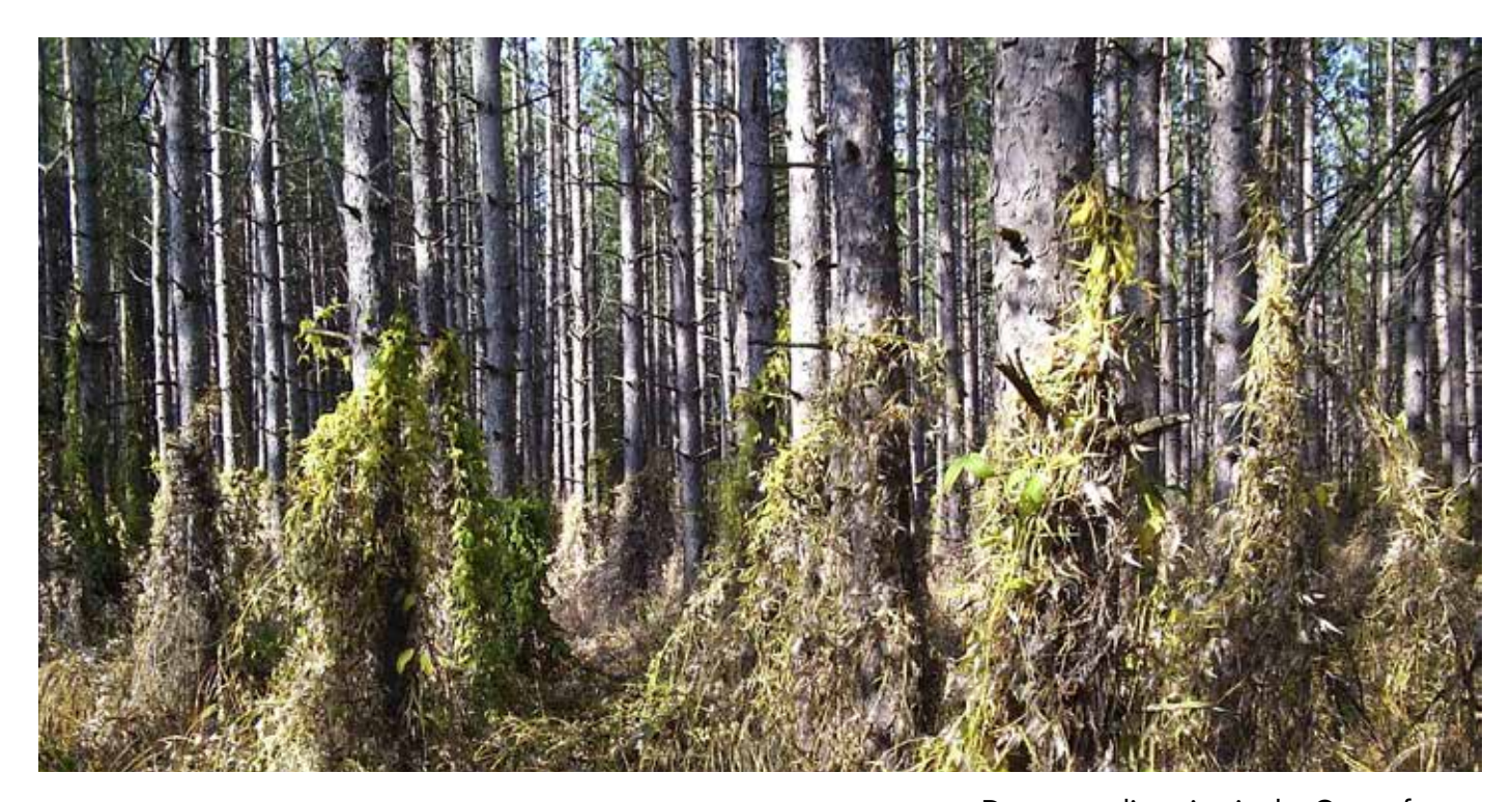
Dog-strangling vine in the Orono forest.

Forestry operations can also be affected by the dense mats formed by dog-strangling vine. These tangles of vegetation can slow down tree marking and walking access which could increase tree marking costs. They would also slow down anyone using a chainsaw in an affected area. However, the biggest challenge for forest managers is the regeneration of the understory (trees and other natural vegetation) on sites with dog-strangling vine.