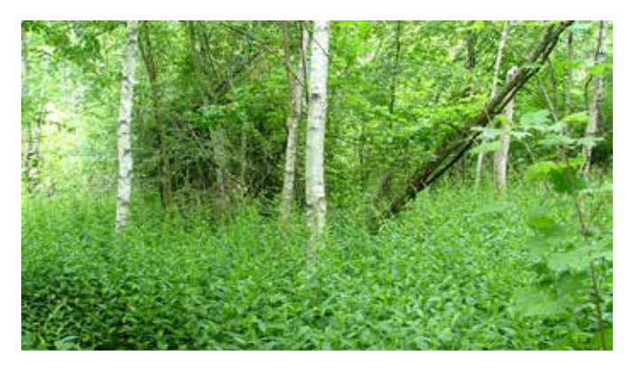
Dog-strangling vine monoculture.

Dog-strangling vine can form extensive, monospecific stands that out-compete native plants for space, water and nutrients. It creates heavy shade and produces chemicals through allelopathy (the release of chemicals from the root of a plant into the soil to discourage other plants from growing nearby) that alter ecosystem structure and function. Dog-strangling vine threatens rare vegetation communities such as alvars, tallgrass prairies, oak savannah and oak woodlands and their associated species. It can also displace rare and sensitive plant species.