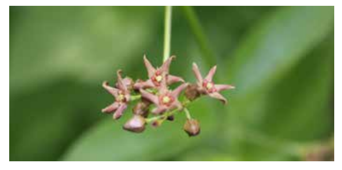
Dog-strangling vine flowers can range in colour from red-brown to pinkish.

Dog-strangling vine flowers in late June and July. The flowers emerge at the axils of the leaves in clusters of 5-20 flowers. The flowers have five petals and are red-brown or maroon to pinkish in colour.