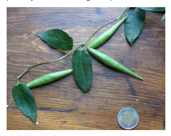
Black dog-strangling vine.

Black dog-strangling vine is native to Ukraine and surrounding areas of Europe and Asia, and was probably introduced as a garden plant.