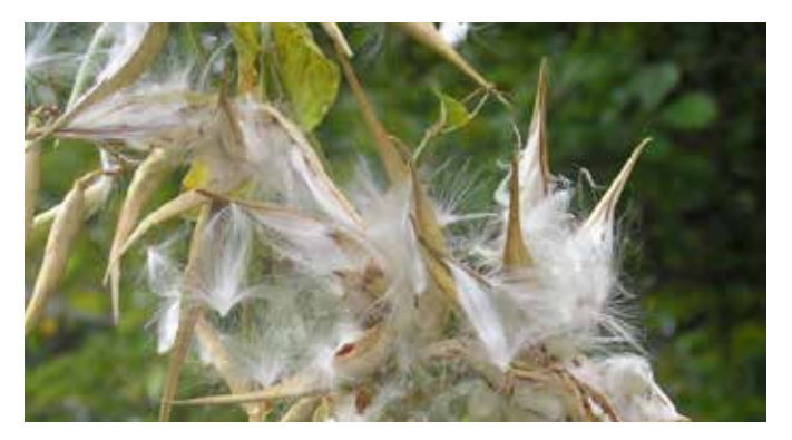
Dog-strangling vine seeds are attached to feathery tufts of hair.

In late July and August, long slender pod-like fruit (follicles) form. There are often two smooth pods at each leaf axil (angle between the upper side of a leaf or stem and the supporting stem or branch). The pods are 4-7 cm (1.5-3") long and 0.5 cm (0.2") wide. The pods contain a milky sap and turn from green to light brown as they grow. The pods split open to release the seeds and similar to other members of the milkweed family, the seeds are attached to feathery tufts of hair (called coma) that aid in their distribution via wind.