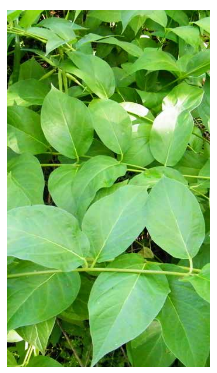
Dog-strangling vine leaves are opposite, and pointed at the tip.

Leaves are opposite, smooth and green with entire to wavy margins (leaf edges). The leaves can be quite variable in colour from dark green to medium-light green; darker green leaves often have lustre. They can range in size from 7-12 cm (3-5") long and 5-7 cm (2-3") wide and are oval to oblong, rounded at the base and pointed at the tip. The leaves are rounder and smaller near the base of the plant, largest at the mid-section and smaller and narrower towards the top of the plant.