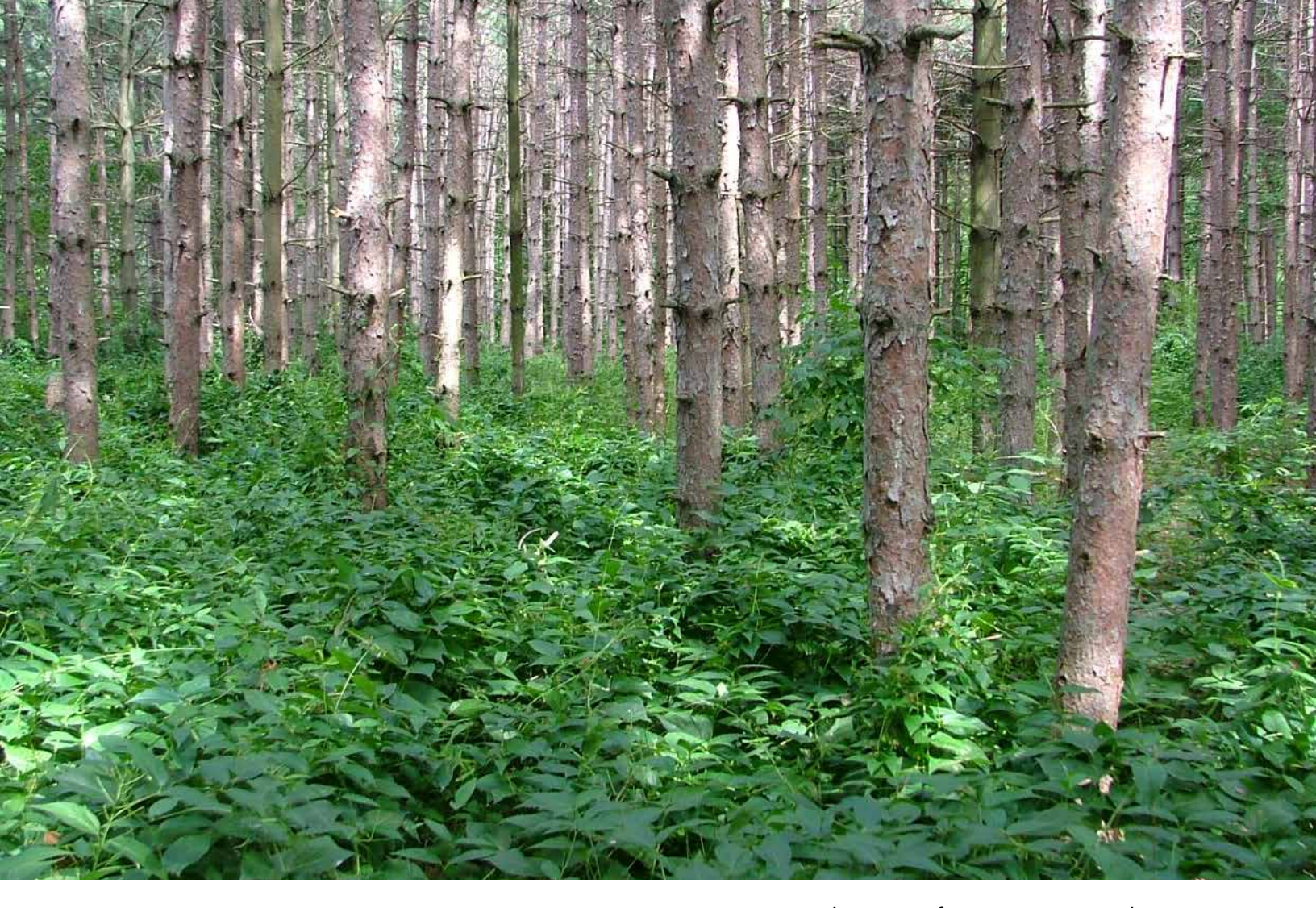
Dog-strangling vine infestation in a pine plantation.