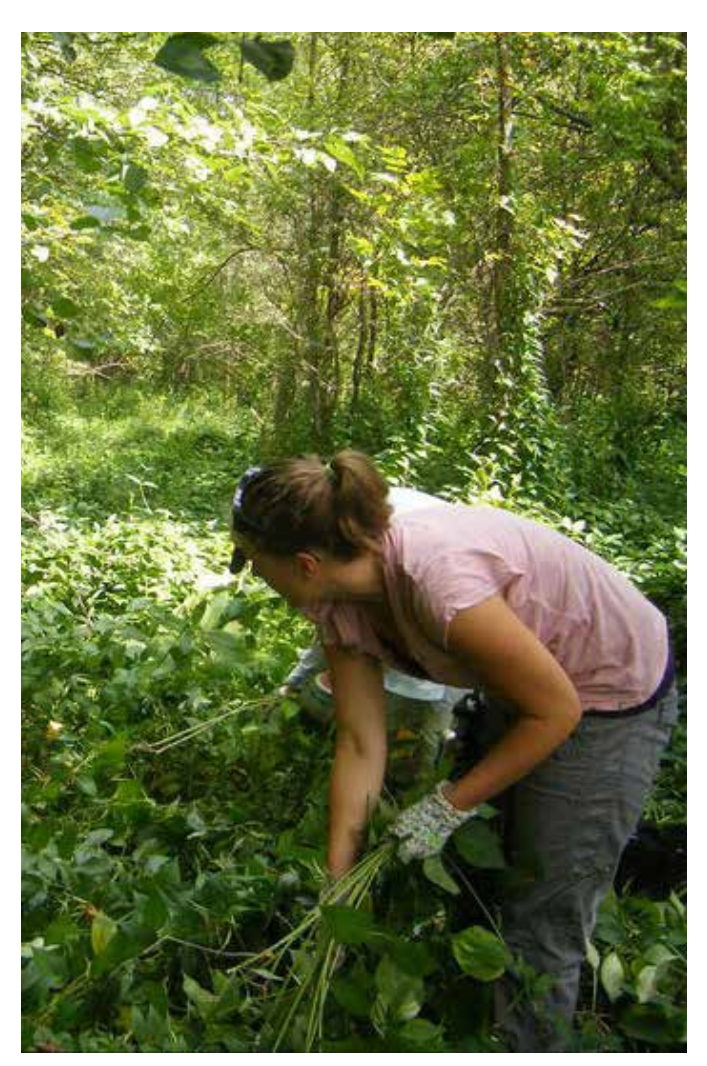
Pulling dog-strangling vine.

Pulling removes above-ground vegetation and can prevent seeds from forming, however, the stems break easily when pulled, leaving the root crown in place. If the entire root system is not removed, dog-strangling vine can resprout from the root, often more aggressively. As with other methods, pulling may need to be repeated throughout the growing season to ensure plants aren't re-sprouting and setting seed. Note: It's recommended to re-visit any site where dog-strangling vine has been pulled for at least three years following control and multiple times throughout the summer as seedlings can quickly mature in the disturbed soil left from previous digging.