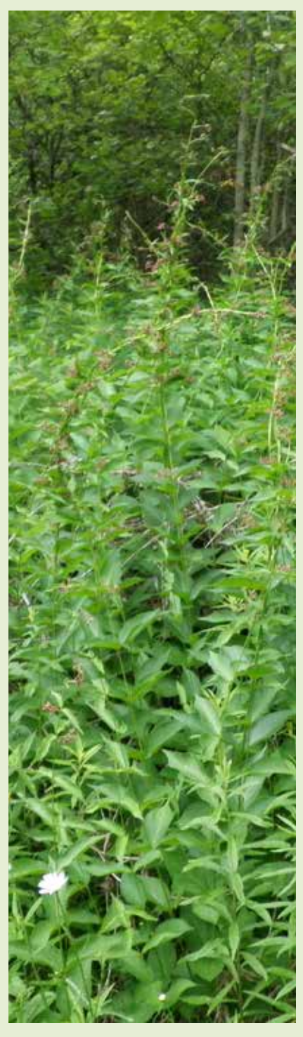
Dog-strangling vine will grow up available structures, such as trees.