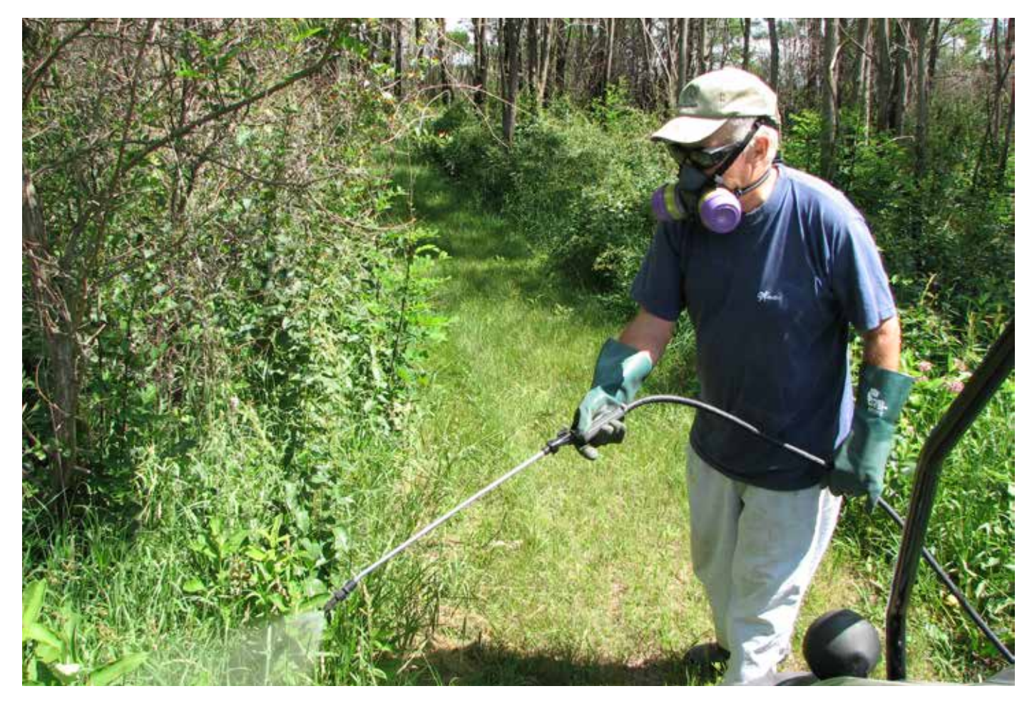
Chemical control of dog-strangling vine.

All herbicides that are effective for control of established dog-strangling vine move systemically within the plant. Unless otherwise indicated on the product label, plants should be treated after leaves are fully expanded. Once existing plants are under control, re-treating the seedling growth will be needed for a number of subsequent years.