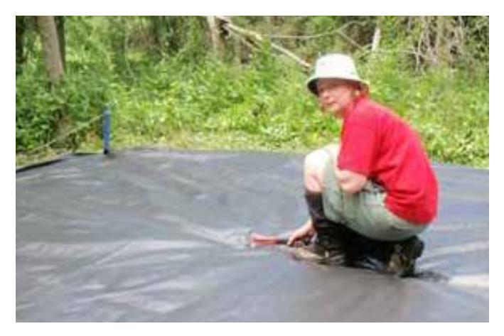
Tarping a dog-strangling vine infestation.

Tarping refers to covering an invasive plant population with a dark material to block sunlight and "cook" the root system. Tarping is not recommended in low light areas. Tarping is most effective when started in late spring and continued through the growing season and is a viable control method for medium to larger infestations. This method is best for monocultures. To tarp an area, first cut dog-strangling vine stems, taking care not to spread seeds to new areas (this is best done in late spring/early summer before the plant has produced seed). Next, cover the infested area with a dark coloured tarp or heavy material. Weed barriers used by landscapers or blue poly tarps are good options. Take care to weigh down the tarp material so it doesn't blow away, but be sure it is still receiving adequate sun exposure. Tent pegs work well as long as the ground isn't too rocky. The tarp may need to be left in place for more than one growing season to ensure effective control. Monitor for plants growing out from under the edges of the tarp. As with many of the control measures listed in this document, re-planting the area with native vegetation will help to suppress re-sprouting and assist in preventing new invaders from establishing. Since tarping essentially "cooks" the soil, mycorrhizae (beneficial soil fungi) may need to be added when re-planting.