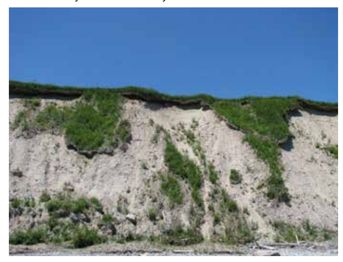
Dog-strangling vine invading Lake Ontario bluffs.