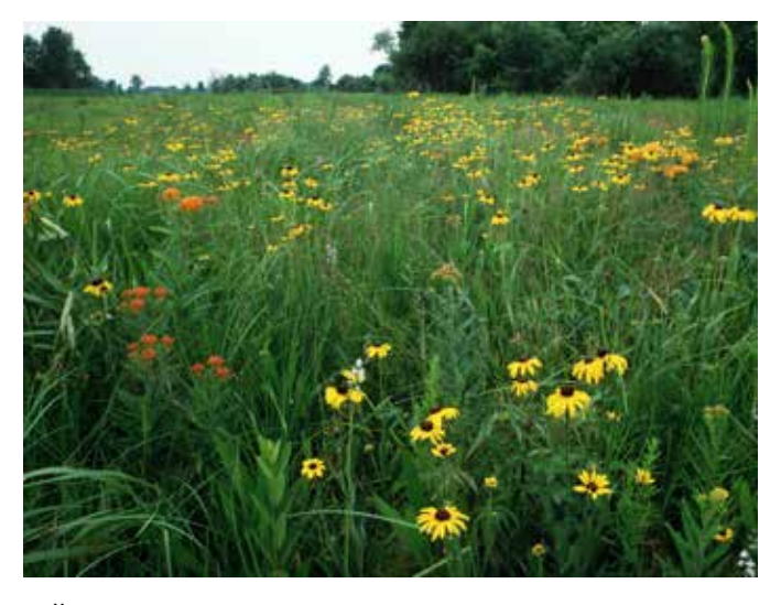
Tallgrass prairie.