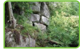
Crevices and Caves (p. 24)