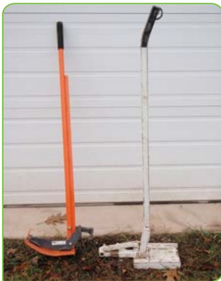
Various weed wrenches (CVC)

These tools are great for pulling out large shrubs up to 2 to 2 1/2 inches in diameter. There are a variety of them out there. Below are listed a couple of companies that supply such tools in Canada.