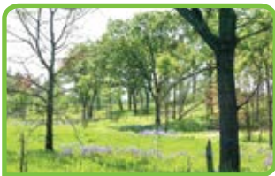
Tallgrass Woodlands (p. 30)