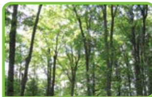
Forest (p. 30)