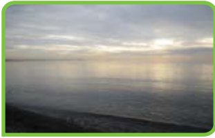
Shorelines/Beaches (p. 20)