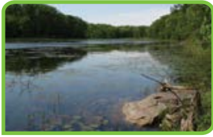
Aquatic Communities (p. 16)