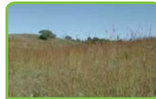
Tallgrass Prairies (p. 29)