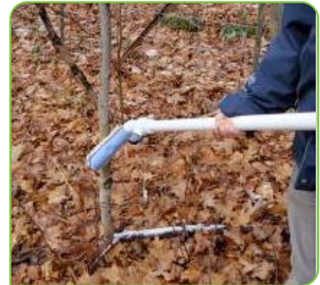
Basal bark application with a weed-wicker (CVC)