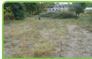
Sand Barrens (p. 28)