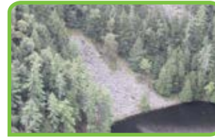
Talus (p. 23)