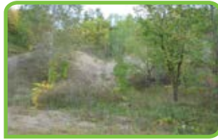
Sand Dunes (p. 21)