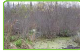
Thicket Swamps (p. 17)