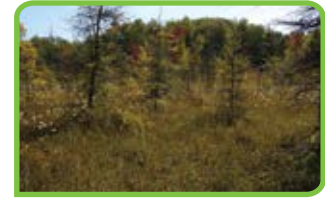
Bogs (p. 19)