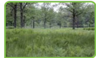
Tallgrass Savannahs (p. 29)