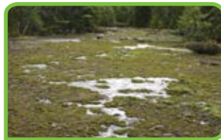
Alvars (p. 27)