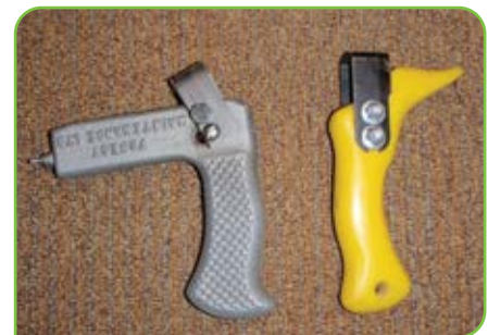
Tree girdlers (CVC)

starve it of nutrients and it will die over a period of a year or two. This type of wounding may allow also for the uptake of a herbicide through the wound that would not penetrate the bark such as a Glyphosphate product.