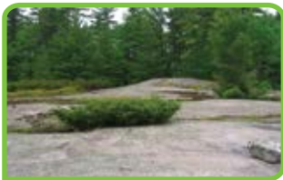
Rock Barrens (p. 25)