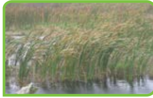
Marshes (p. 16)