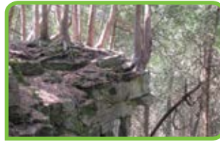
Cliffs (p. 22)