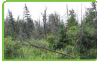
Treed Swamps (p. 17)