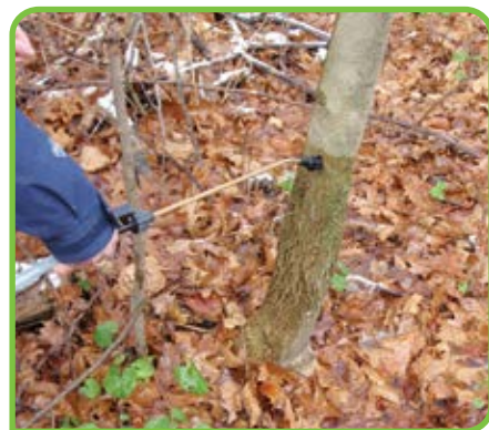
Streamline basal spray (CVC)

A modified method, streamline basal sprays, is effective for many woody species up to 2 inches in diameter, as well as trees and shrubs up to 6 inches in diameter if the species is susceptible. Equipment for this treatment is a backpack sprayer with a spray gun and a low-flow straight-stream or narrow-angle spray tip. To prevent waste, maintain pressure below 30 pounds per square inch with a pressure regulator. At this pressure, an effective reach of 9 feet is possible while bark splash is minimized. For